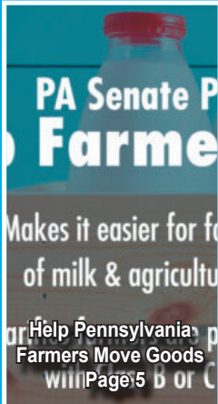
Help Pennsylvania Farmers Move Goods Page 5 b or C