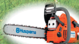
Husqvarna Chain saw