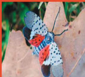
Adult (with wings open) can be found July-December