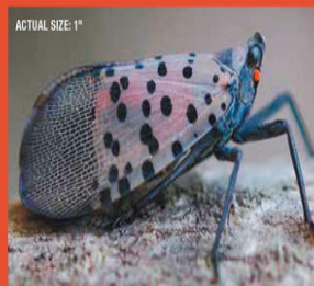
Adult (with wings closed) can be found July-December