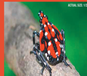
Nymph (late stage) can be found July-September