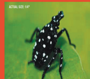
Nymph (early stage) can be found late April-July