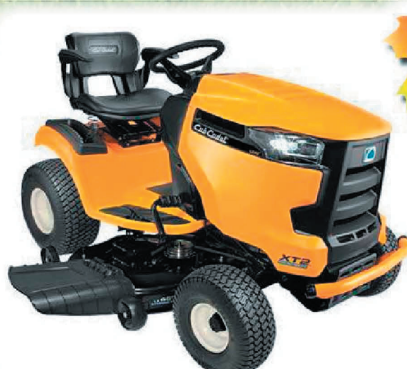
Cub Cadet XT Enduro Series