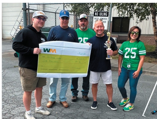
1st place Pen Argyl Masonic Lodge $1000

1st prize went to Pen Argyl Masonic Lodge $1000 2nd place WEONA Park Pals $600 and 3rd Wind Gap Fire Co. $400. Other groups were Pen Argyl Families First, Look Out Fire Co., Plainfield Fire Co.