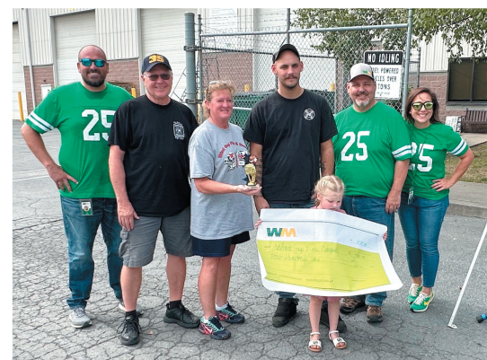
3rd place Wind Gap Fire Co. $400