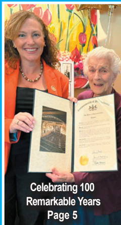
Celebrating 100 Remarkable Years Page 5