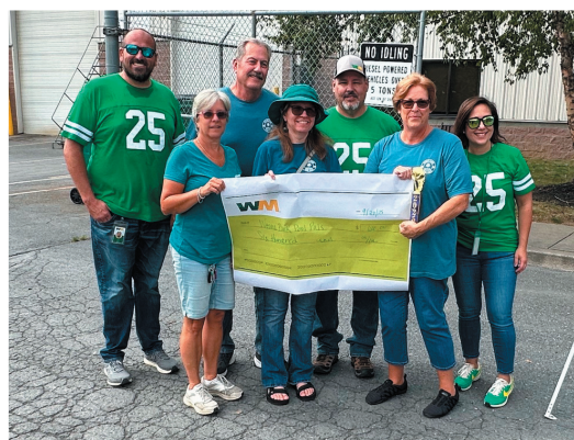
2nd place WEONA Park Pals $600