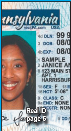
Real ID page 5