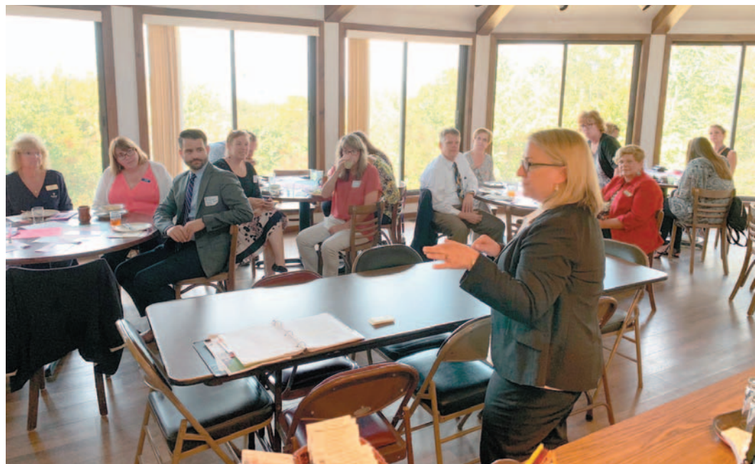
Congress Woman Susan Wild discusses the future of the Slate Belt at the scenic Kirk Ridge Lodge over looking the Slate Belt and the Poconos.