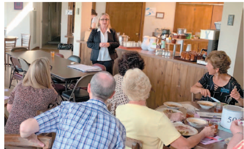
Congress Woman Susan Wild discusses her opinions of work to be done in her district