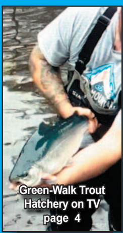
Green-Walk Trout Hatchery on TV page 4