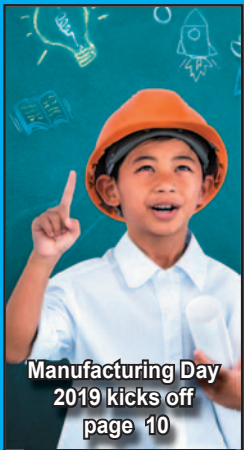
Manufacturing Day 2019 kicks off page 10