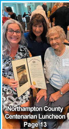
Northampton County Centenarian Luncheon Page 13