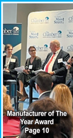
Manufacturer of The Year Award Page 10