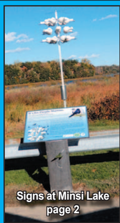
Signs at Minsi Lake page 2