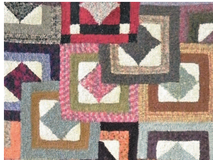
*BEST OF SHOW: "Auditioning the Stash" Tracy Granger, East Stroudsburg (photo attached) Fiber Art Category