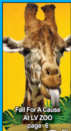
Fall For A Cause At LV ZOO page 6