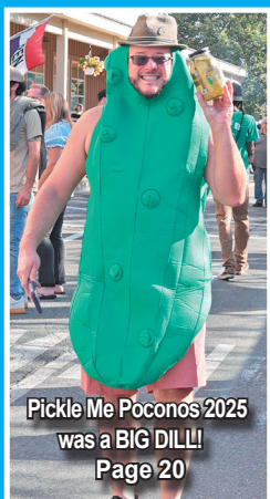
Pickle Me Poconos 2025 was a BIG DILL! Page 20