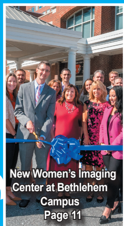
New Women's Imaging Center at Bethlehem Campus Page 11