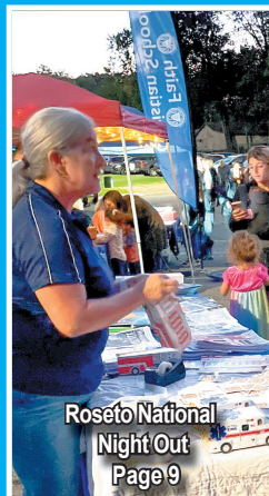
Rose to National Night Out Page 9

COLUMBIA STORAGE GROUP Columbia Self Storage