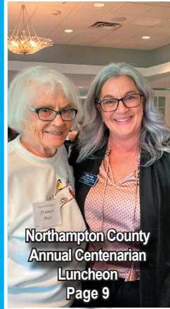
Northampton County Annual Centenarian Luncheon Page 9