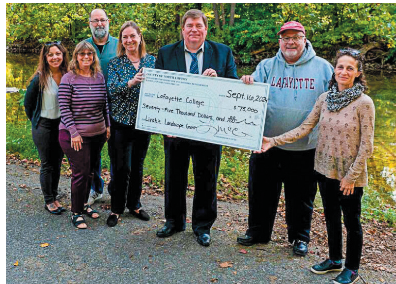
Plans for the trail are expected to be completed in 2025.

The college applied for the grant in the spring, according to Sherry Acevedo, the conservation coordinator for Northampton County Parks and Recreation. As part of the application, the Forks Township Board