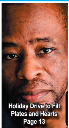
Holiday Drive to Fill Plates and Hearts Page 13