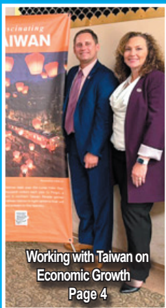
Working with Taiwan on Economic Growth Page 4