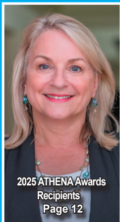
2025 ATHENA Awards Recipients Page 12