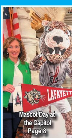
Mascot Day at the Capitol Page 8