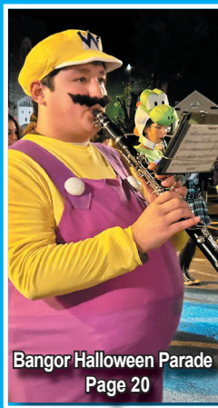
Bangor Halloween Parade Page 20

COLUMBIA STORAGE GROUP Columbia Self Storage