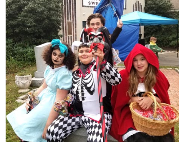
Photos top row Left to Right: Ages 5-10 winners, Ages 2-4 winners, Ages 11-15 winners.