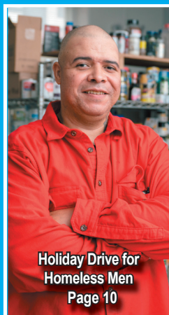
Holiday Drive for Homeless Men Page 10