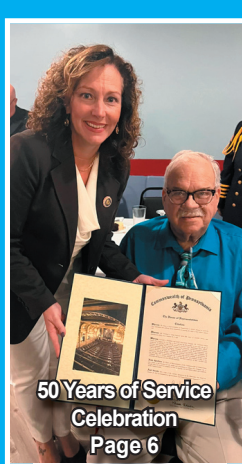
50 Years of Service Celebration Page 6