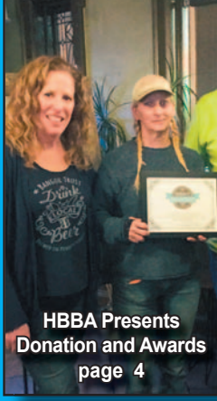
HBBA Presents Donation and Awards page 4