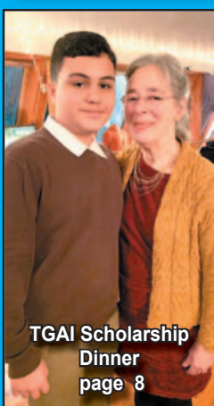
TGAI Scholarship Dinner page 8