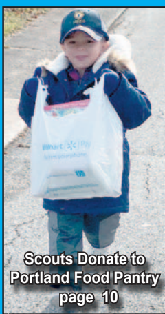
Scouts Donate to Portland Food Pantry page 10