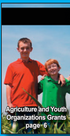
Agriculture and Youth Organizations Grants page 6