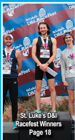
St. Luke's D&I Racefest Winners Page 18