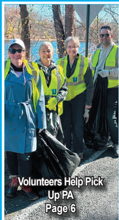
Volunteers Help Pick Up PA Page 6