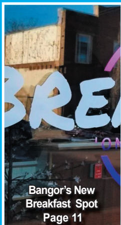
Bangor's New Breakfast Spot Page 11