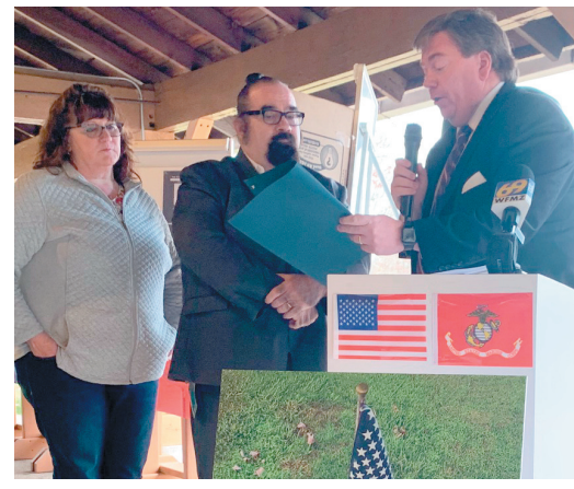
Northampton County Executive LaMont McClure