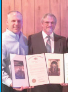
Recognition of Local Fire Fighters page 11