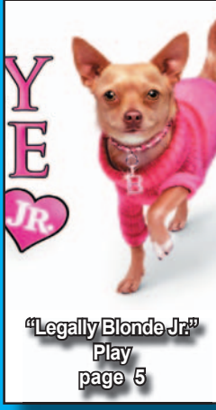
"Legally Blonde Jr." Play page 5