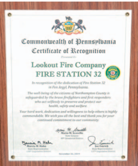
Plaque from the House and Senate commemorating the new Lookout #32 Fire Station