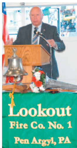
State Senator Mario Scavello