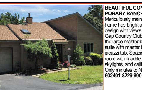
BEAUTIFUL CONTEM-PORARY RANCH HOME-Meticulously maintained nome has bright and airy lesian with views of Water Gap Country Club. Relax in the large master bedroom suite with master bath & acuzzi tub. Spacious living oom with marble fireplace skylights, and ceiling fan. Only minutes to NJ. MLS#

The Blue Mountain Community Library is located at 216 S. Robinson Ave. in Pen Argyl. Hours are 10-12, Monday thru Saturday mornings and 6-8, Monday thru Thursday evenings. Stop in and check off all the readers on your Holiday List! Call 610-863-3029 for information or visit www.bmcl.org. Find us on Facebook at www. facebook.com/bmclpenargyl.