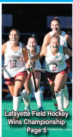
Lafayette Field Hockey Wins Championship Page 5