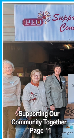
Supporting Our Community Together Page 11