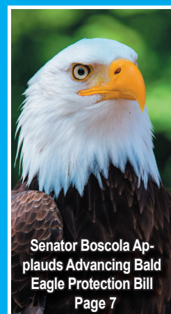
Senator Boscola Ap- plauds Advancing Bald Eagle Protection Bill Page 7