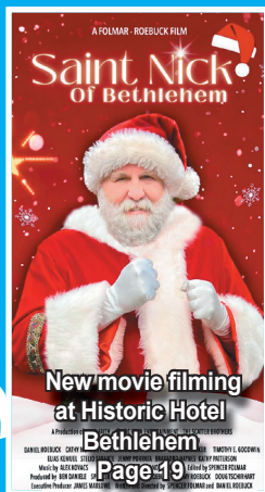
New movie filming at Historic Hotel Bethlehem Page 19