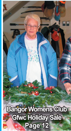
Bangor Womens Club Gfwc Holiday Sale Page 12