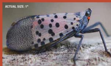
Actual Size: 1" Adult (with wings closed) can be found July–December