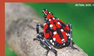
Actual Size: 1/2" Nymph (late stage) can be found July–September