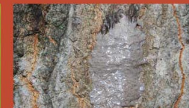
Egg mass (fresh) can be found October–December