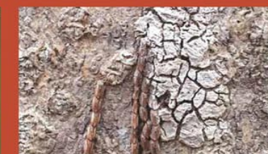
Egg mass (older) can be found January–June