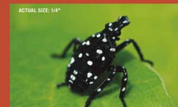
Actual Size: 1/4" Nymph (early stage) can be found late April–July