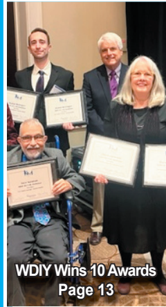
WDIY Wins 10 Awards Page 13