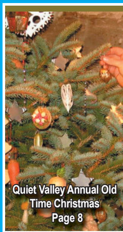
Quiet Valley Annual Old Time Christmas Page 8