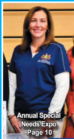
Annual Special Needs Expo Page 10