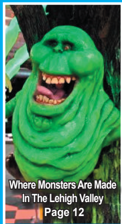
Where Monsters Are Made In The Lehigh Valley Page 12