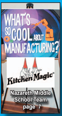
Nazareth Middle School Team page 7