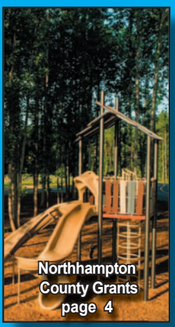
Northampton County Grants page 4