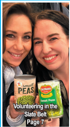
Volunteering in the Slate Belt Page 7