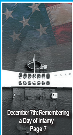
December 7th: Remembering a Day of Infamy Page 7