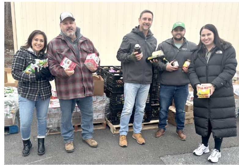
Wm Volunteers at Mission of Love Food Hub the week of Thanks Giving