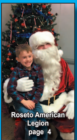
Roseto American Legion page 4