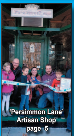
'Persimmon Lane' Artisan Shop page 5