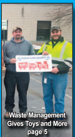
Waste Management Gives Toys and More page 5