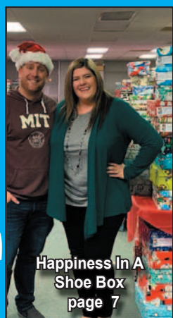
Happiness In A Shoe Box page 7