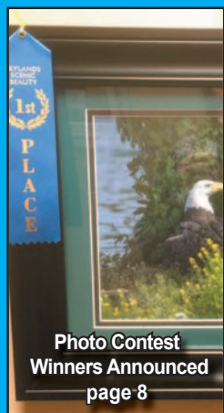
Photo Contest Winners Announced page 8