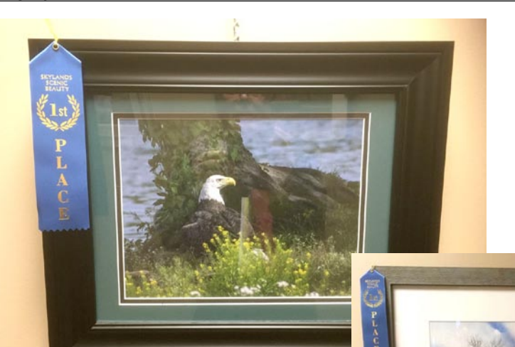
Twenty-Fourth Annual Scenic Skylands Photo Contest Winners Announced