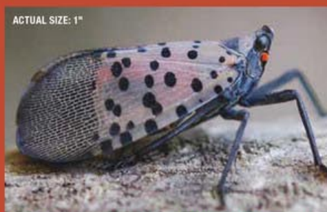
Adult (with wings closed) can be found July–December