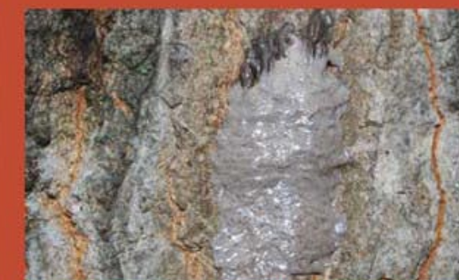
Egg mass (fresh) can be found October–December