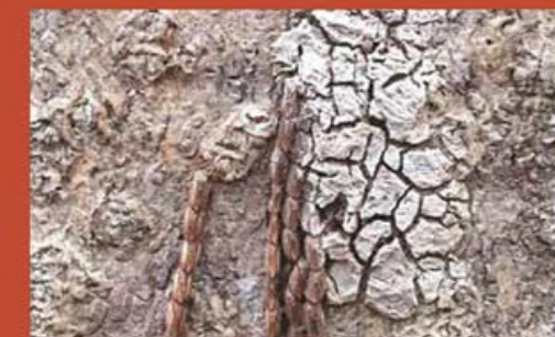
Egg mass (older) can be found January–June