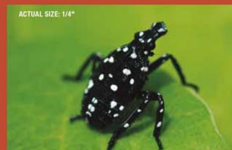
Nymph (early stage) can be found late April–July