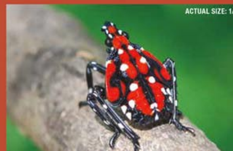
Nymph (late stage) can be found July–September