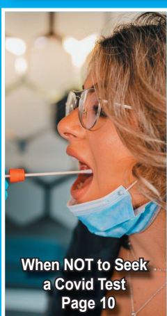
When NOT to Seek a Covid Test Page 10