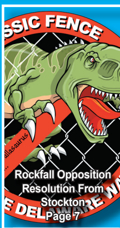
Rockfall Opposition Resolution From Stockton DE DEL Page 7