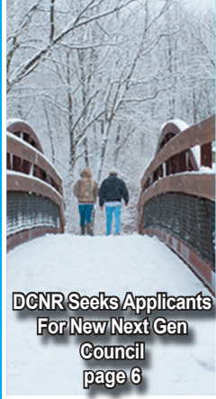
DCNR Seeks Applicants For New Next Gen Council page 6