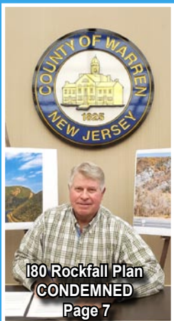
180 Rockfall Plan CONDEMNED Page 7