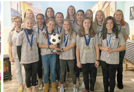
U13 Girls A 2019 Undefeated BMYSL League Champions and Garcia Cup Champions