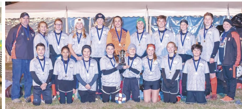
U15 Boys (coed) 2019 BMYSL U15 Boys Garcia Cup Champions