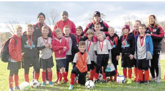
U11 Boys A 2019 Garcia Cup Runner-up