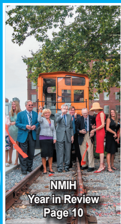
NMIH Year in Review Page 10