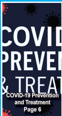
COVID-19 Prevention and Treatment Page 6