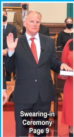
Swearing-in Ceremony Page 9