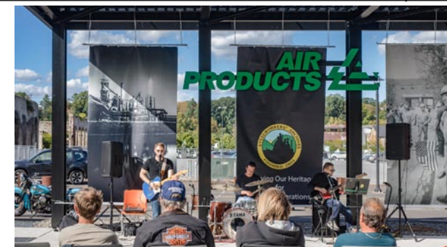
Air Products Pavilion