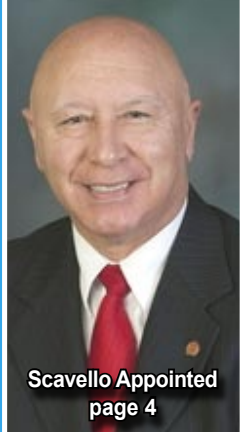
Scavello Appointed page 4