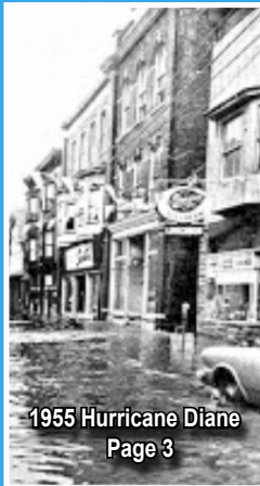
1955 Hurricane Diane Page 3