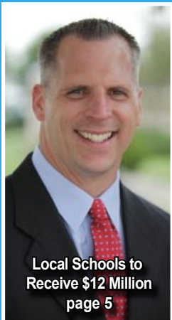
Local Schools to Receive $12 Million page 5