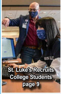
St. Luke's Recruits College Students page 9