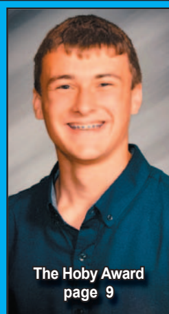
The Hobby Award page 9