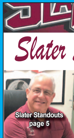
Slater Standouts page 5