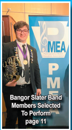
Bangor Slater Band Members Selected To Perform page 11

VOL. 30 NO. 4 SERVING THE SLATE BELT, SOUTHERN POCONOS & NORTHERN N.J. DAILY ONLINE AT WWW.BLUEVALLEYTIMES.COM AND FACEBOOK JANUARY 25, 2022