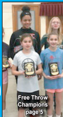
Free Throw Champions page 5