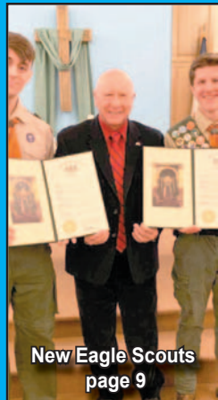
New Eagle Scouts page 9