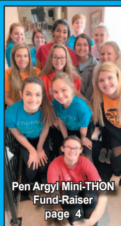
Pen Argyl Mini-THON Fund-Raiser page 4

VOL. 29 NO. 3 SERVING THE SLATE BELT, SOUTHERN POCONOS & NORTHERN N.J. WEEKLY IN PRINT AND DAILY ONLINE AT WWW.BLUEVALLEYTIMES.COM AND FACEBOOK JANUARY 28, 2020