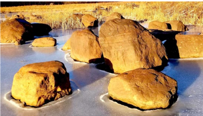
Winter photos of Minsi Lake