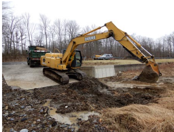
East Shore Boat Launch