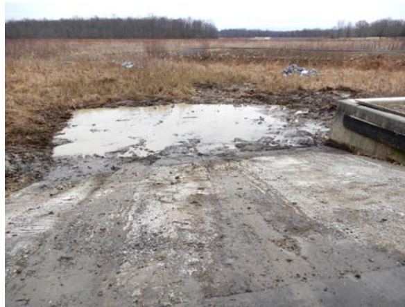
West Shore Boat Launch