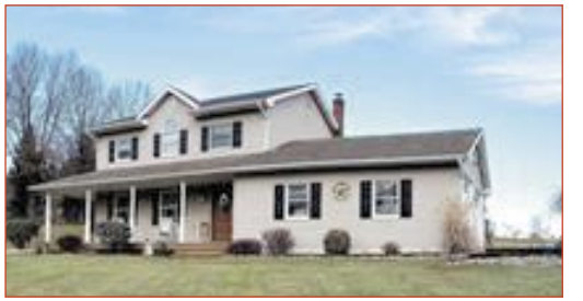
MODERN COLONIAL HOME, in pristine condition, boasts 4+ sprawling acres! Lustrous hardwood flooring, nice-sized dining/kitchen combination, spacious living room, 3 bedrooms and 2 full bathrooms. Vast views, open fields, a sizable paver patio, attached 2 car garage, natural borders, additional utility sheds, and appealing wrap around porch complete the inviting feel that is this home! MLS#598408 $289,900