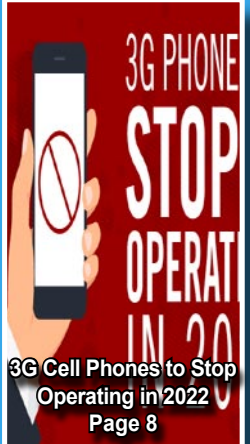
3G Cell Phones to Stop Operating in 2022 Page 8