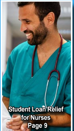
Student Loan Relief for Nurses Page 9