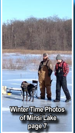
Winter Time Photos of Minsi Lake page 7