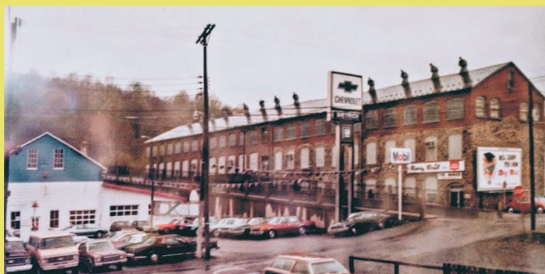
Dietrich's Garage And The Sterling Silk Mill. No Date But A Long Time Ago.