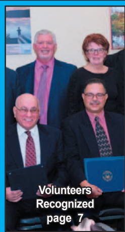
Volunteers Recognized page 7