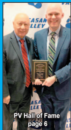
PV Hall of Fame page 6