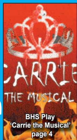
BHS Play 'Carrie the Musical' page 4