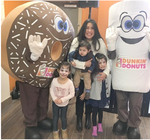
Mascots 'Cuppy & Sprinkles' were on hand and all the children had a chance to get their facepainted