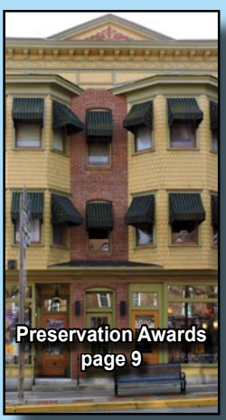
Preservation Awards page 9