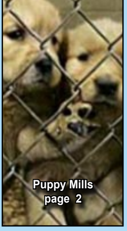
Puppy Mills page 2