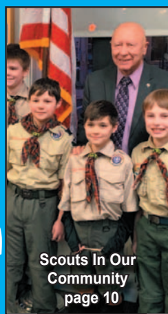
Scouts In Our Community page 10