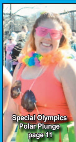
Special Olympics Polar Plunge page 11