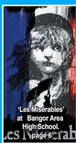
'Les Misérables' at Bangor Area High School. page 6