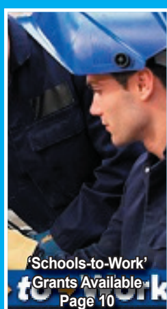
'Schools-to-Work' Grants Available. Page 10