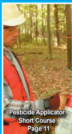
Pesticide Applicator Short Course. Page 11