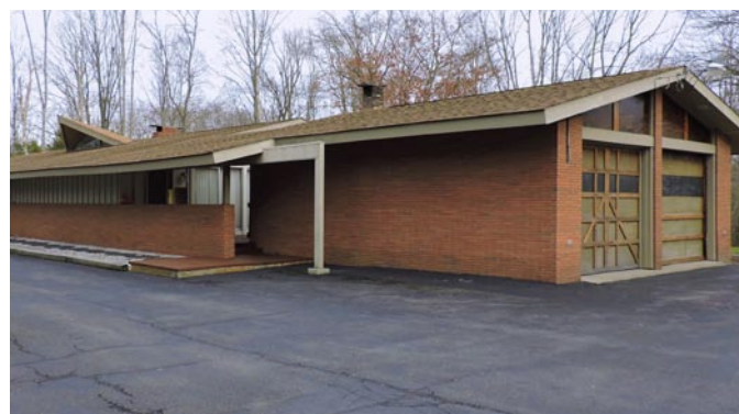
Above - Commercial Property - 616 Main Street (currently occupied by RAW Urban Winery & Hard Cider and Mackey Photo & Video. Top Right - Publicly Funded - Fenner, Snyder, & Robacker Homestead, Hamilton Township. Bottom Right - Residential Property - "Abeloff-Lambert Home"