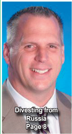
Divesting from Russia Page 8